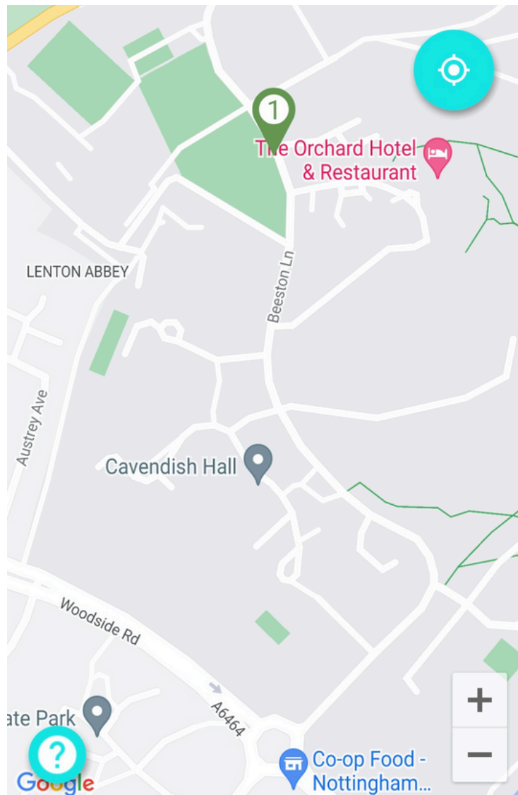
Beeston Lane (near David Ross Sports Village)

MER-FS-AD02120, MER-FS-AD02470, MER-FS-AD02122, MER-FS-AD02123, MER-FS-AD02284