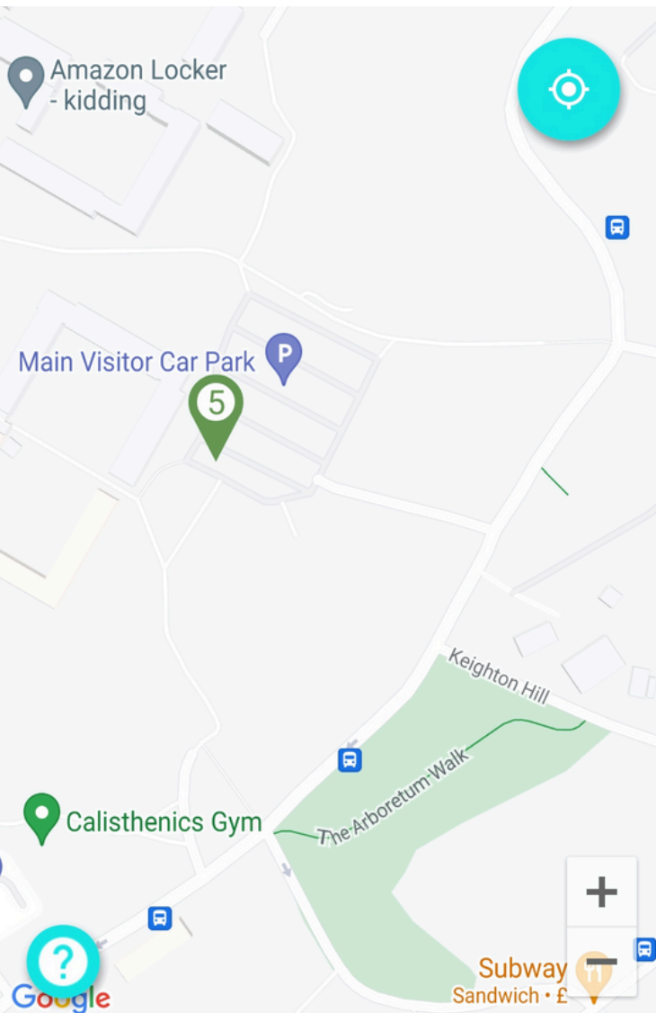
Main Visitor Car Park (next to Sir Clive Granger building)