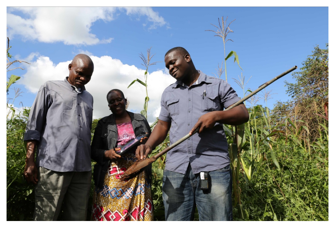
The third round of the University of Nottingham - Rothamsted Research studentship programme remains open. There are five projects on international agriculture available - Apply now!