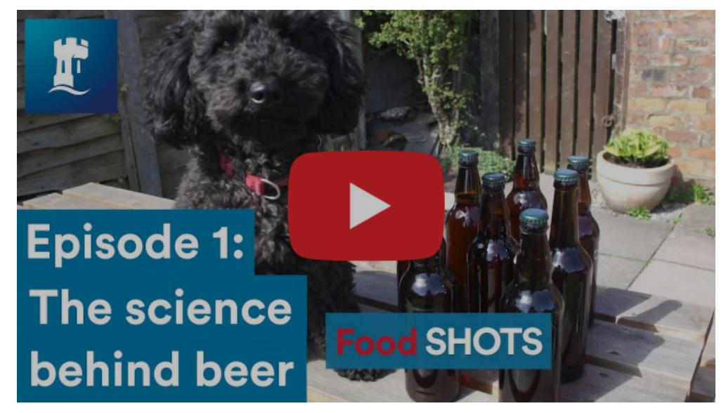
Our YouTube channel features not only our Food Shots series but also videos of our technology platforms!