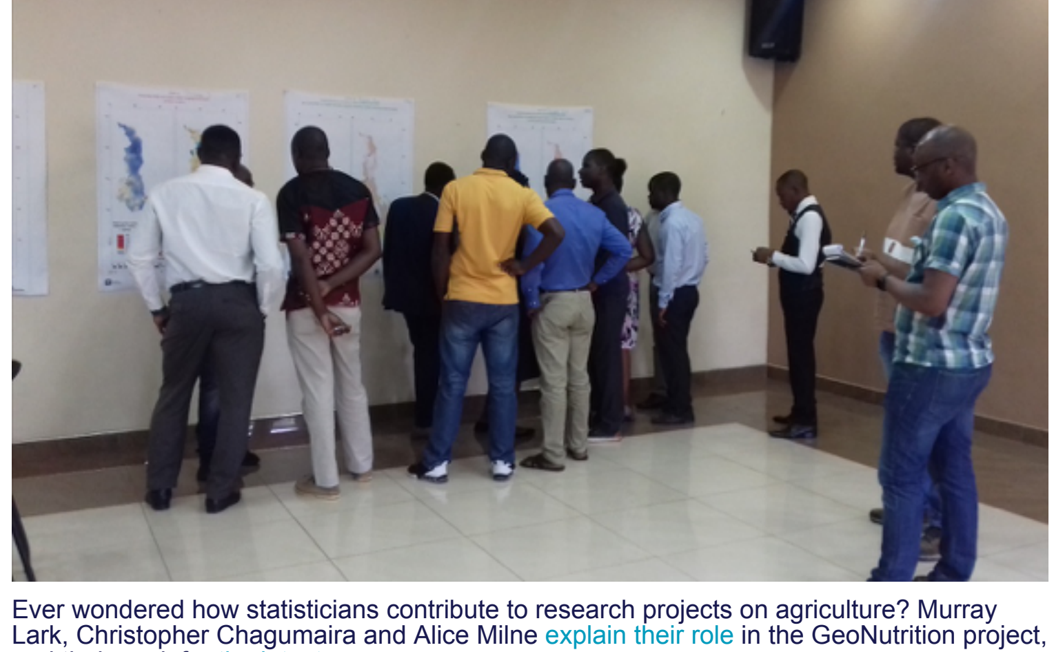
and their work for the latest paper.